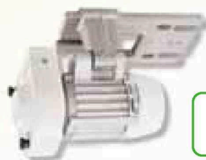
M92 The new model compact-size servomotor