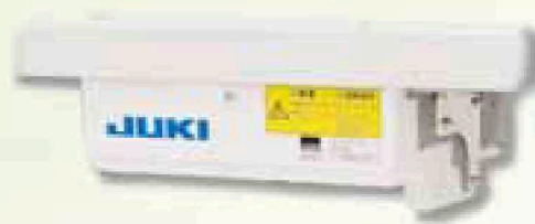
SC-920C The new model control box