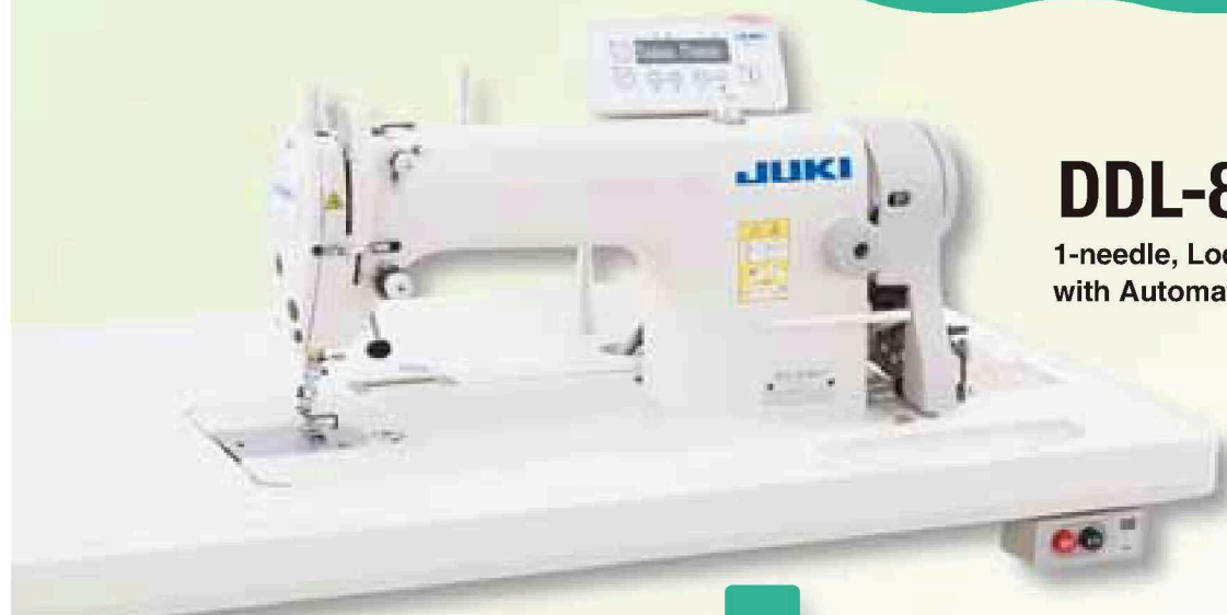
DDL-8700-7 1-needle, Lockstitch Machine with Automatic Thread Trimmer

The DDL-8700-7 is provided with the "new model control box" and the "new model compact servomotor," thereby substantially saving energy.