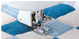
Even Feed Foot (P/No.40058020)