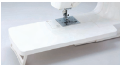
Wide Table (P/No.40058018)